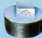
NQ291 堵头 PlugsPlain