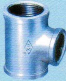
NQ130R 异径三通 TeesBeaded Reducing90°