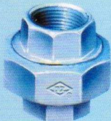
NQ330 平座活接 UnionsFlatSeat WithoutGasket