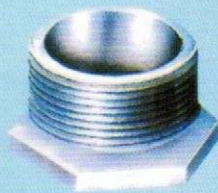
NQ241 内外螺丝 BushingsM. & .F