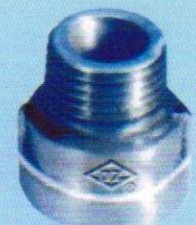
NQ529A 内外丝接头 MaleAnd FemaleJointsSockets