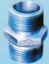
NQ280 内接头 HexagonNipplesEqual RightHandThreads