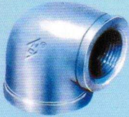
NQ90R 异径弯头 ElbowsBeaded Reducing