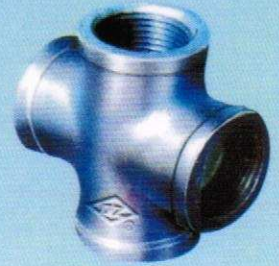
NQ180 四通 CrossesPlainEqual90°