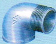
NQ92 内外丝弯头 ElbowsBeaded M. & .F Equal90°