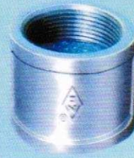
NQ270 外接 SocketsPlainWith RibsRightHandThreads