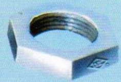
NQ310 根母 Backnuts