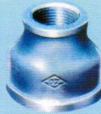
NQ240 异径外接 ConcentricReducing SocketsPlainWithRibs