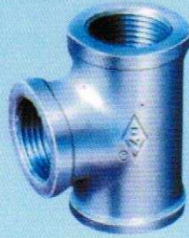
NQ130 三通 TeePlainEqual90°