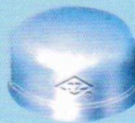
NQ301 管帽 RoundCaps