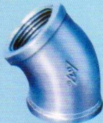
NQ120.45° 弯头 ElbowsPlain 45°