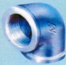
NQ90 弯头 ElbowsPlain Equal90°